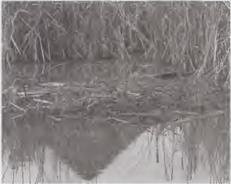
Beaver food cache.